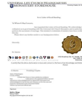
Letter of Good Standing